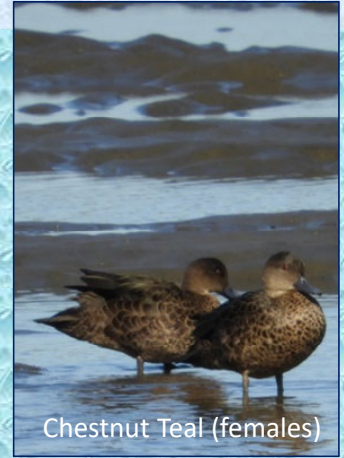
Chestnut Teal (females)